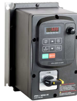
AC drive FUS E5/IP66 [0,37 – 2,2kW] FUS 3E5/IP66 [0,75 – 18,5kW]