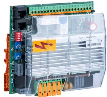
Braking device VB S LP Plc [60A]