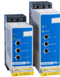
Soft Starters VS II plus 400-6...32