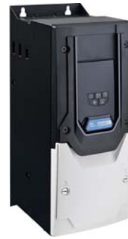
AC Drive VD i 1100 ... 16000/3Pro/IP55